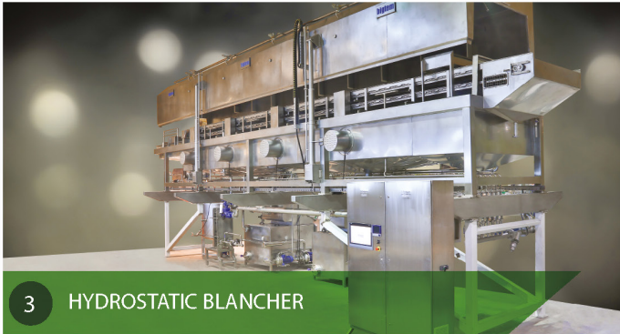
3 HYDROSTATIC BLANCHER