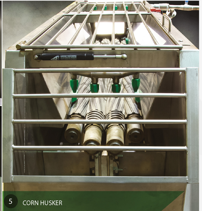
5 CORN HUSKER