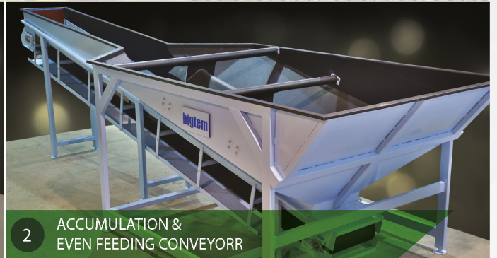
2 ACCUMULATION & EVEN FEEDING CONVEYOR